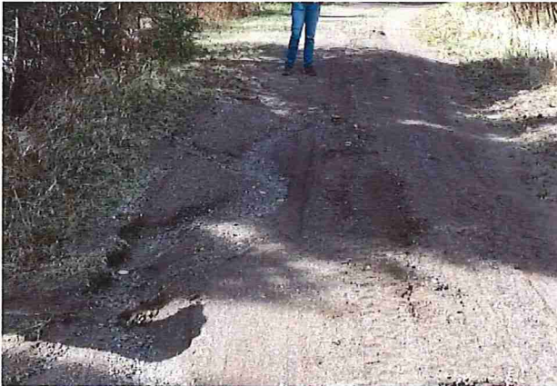
Erosion on Crown Creek Culvert upstream from undersized culvert

The Crown Creek Road homeowner's association is requesting technical and financial assistance from Lake SWCD for survey, design, and installation in 2018/19.