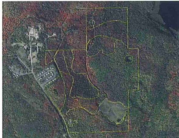
Gilbertson property, 7176 Airbase Rd, Finland

Gretchen Gilbertson's Forest Stewardship Plan completed. 193 acres were inventoried and management recommendations were offered that matched the landowner's goals with the potential of the land. An invoice has been submitted to the landowner in the amount of $1,651.00.