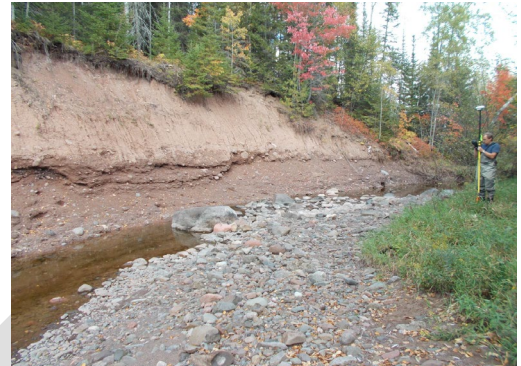
An eroding bank on the Stewart River to be stabilized through the CWF/SOGL Stewart River project.

The Stewart River Watershed Protection Project, funded by BWSR through the Clean Water Fund, received a $105,076 grant for work in 2012-2016. This grant was awarded in conjunction with a grant for the Knife River Watershed Protection Project (see Section IV.B above). After the June, 2012 flooding event in northeast Minnesota, the Stewart River project received additional funding through state flood relief cost-share funds. Additional funds were secured for the project through a 2014 Sustain our Great Lakes (SOGL) grant for $378,471, and $145,000 in funding for debris and sediment removal was secured through a grant administered by the Minnesota DNR in December, 2014. Additional funds and resources were provided for the project through cash matches from Minnesota Trout Unlimited, the Minnesota DNR, as well as in-kind services from Wildland Hydrology and the South St. Louis SWCD. These funds and resources were allocated for design and construction of erosion control practices on high-priority erosion sites along the Stewart River. This was constructed during the 2015 field season. Adaptive management was completed on the Stewart River Big Rock Road project in 2016, including repairs to instream structures and vegetative plantings. Access roads for these repairs caused significant damage to previously planted vegetation, which will be replaced in 2017. Additional adaptive management will be performed at the Liukkonen site on the Waldo Road.