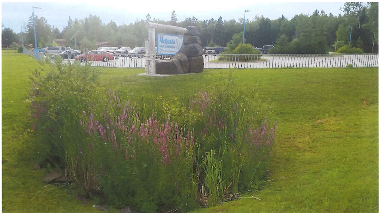
Purple loosestrife at the McQuade Safe Harbor parking area