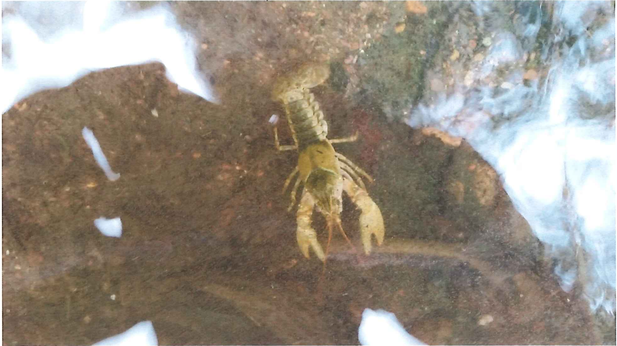
Most common crayfish (orconectes propinquus)