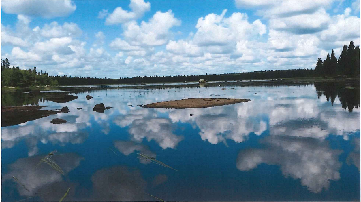
Cabin Lake crayfish traps (no cabins)