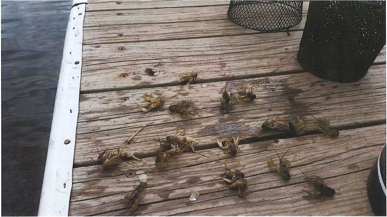
Lax Lake crayfish